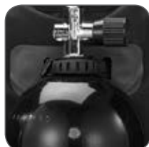
Valve Retention Strap