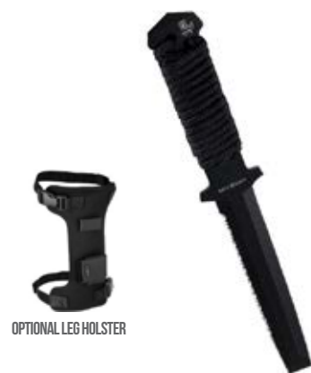
OPTIONAL LEG HOLSTER