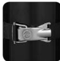
GripLock™ Tank Band