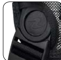
Swivel shoulder buckles