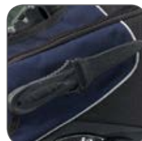
Knife Attachment Points