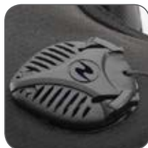
Flat e-valve Technology