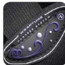
Wrapture Harness System