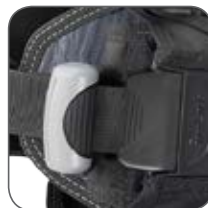
SureLock™ II Weight System